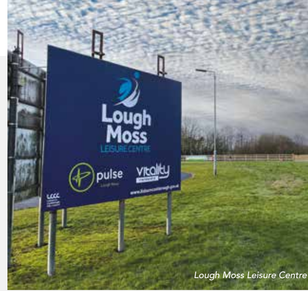
Lough Moss Leisure Centre