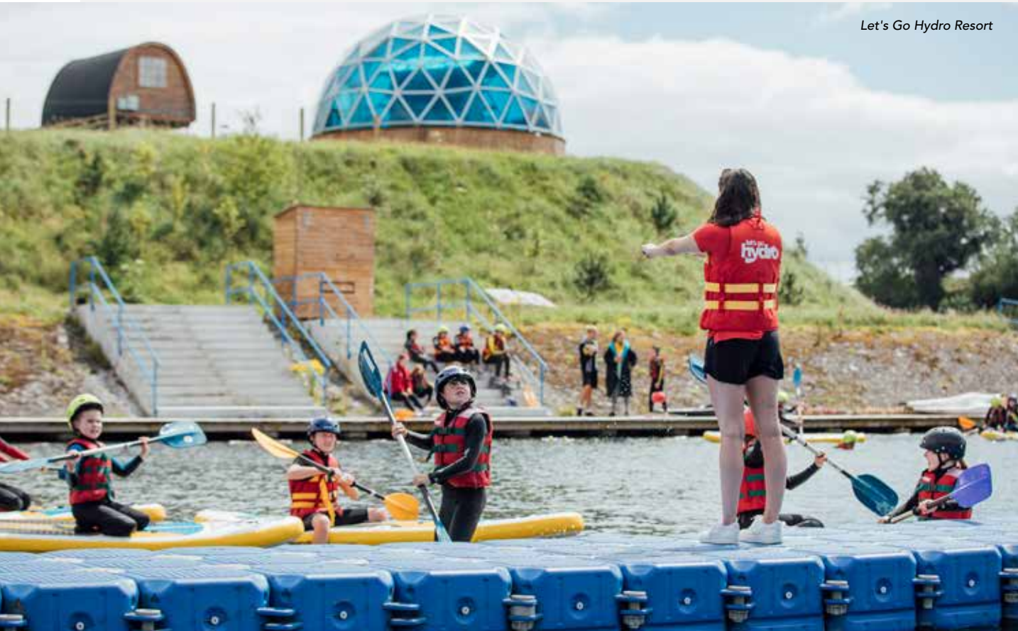
Let's Go Hydro Resort