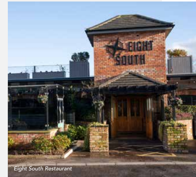
Eight South Restaurant