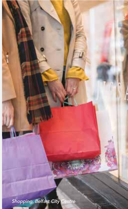
Shopping, Belfast City Centre