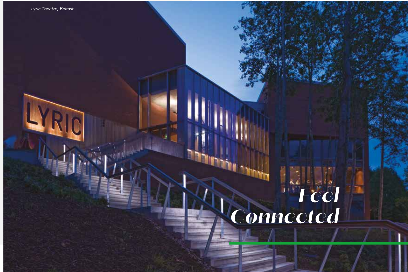
Lyric Theatre, Belfast