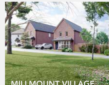
MILLMOUNT VILLAGE Dundonald