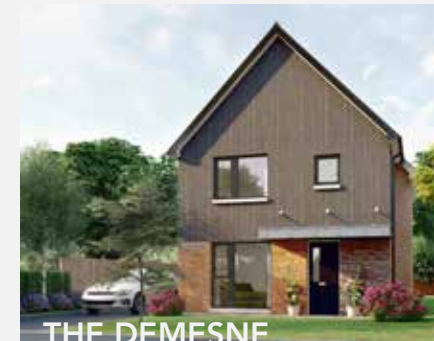
THE DEMESNE Woodbrook, Lisburn