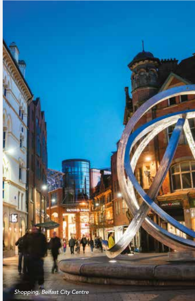
Shopping, Belfast City Centre