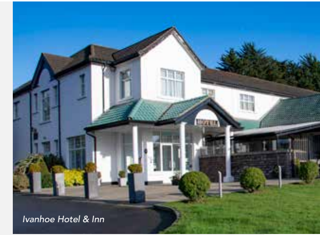
Ivanhoe Hotel & Inn