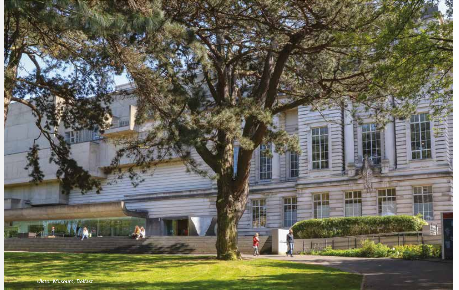
Ulster Museum, Belfast