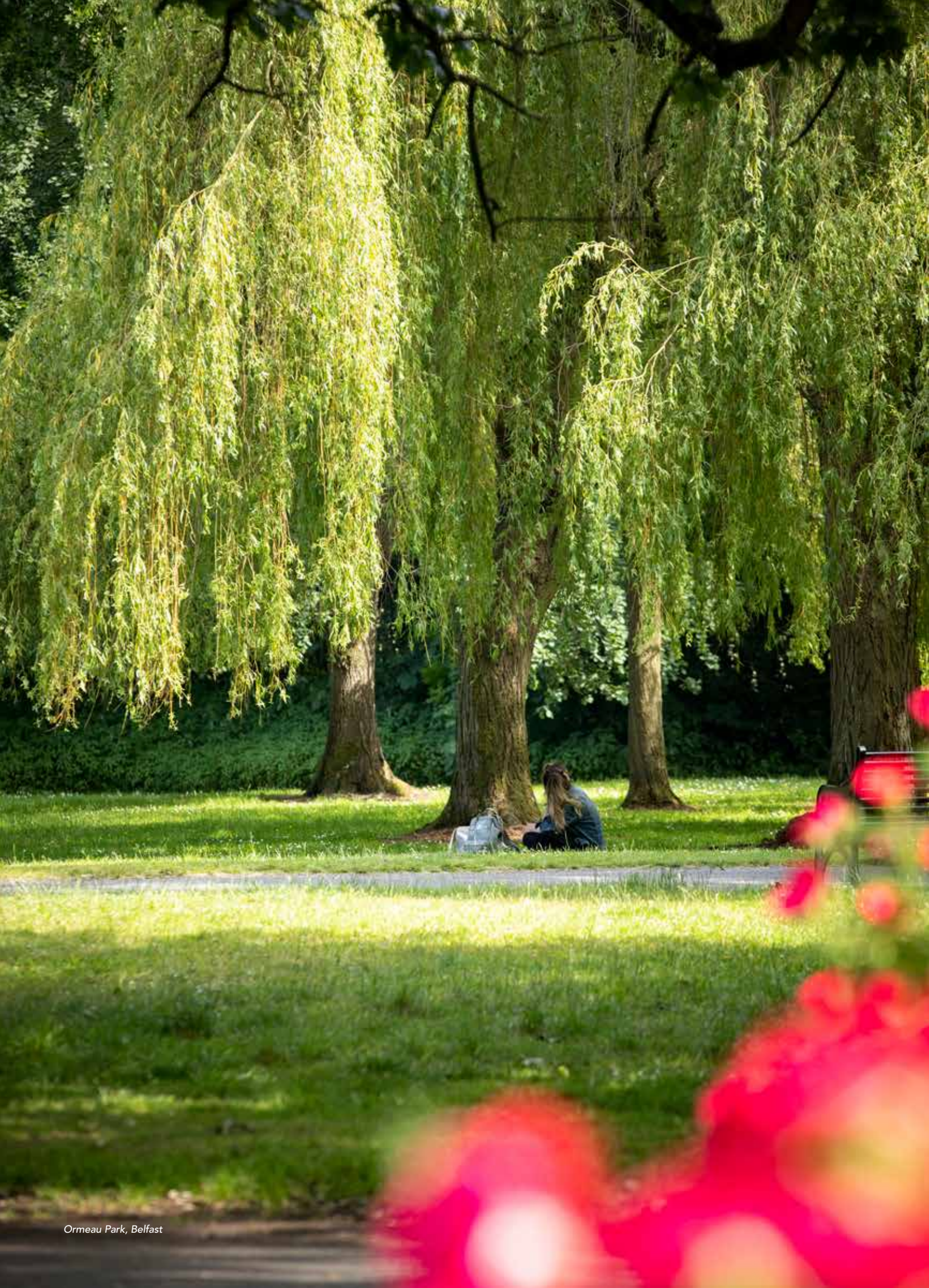
Ormeau Park, Belfast