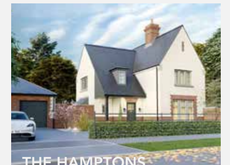
THE HAMPTONS Belfast