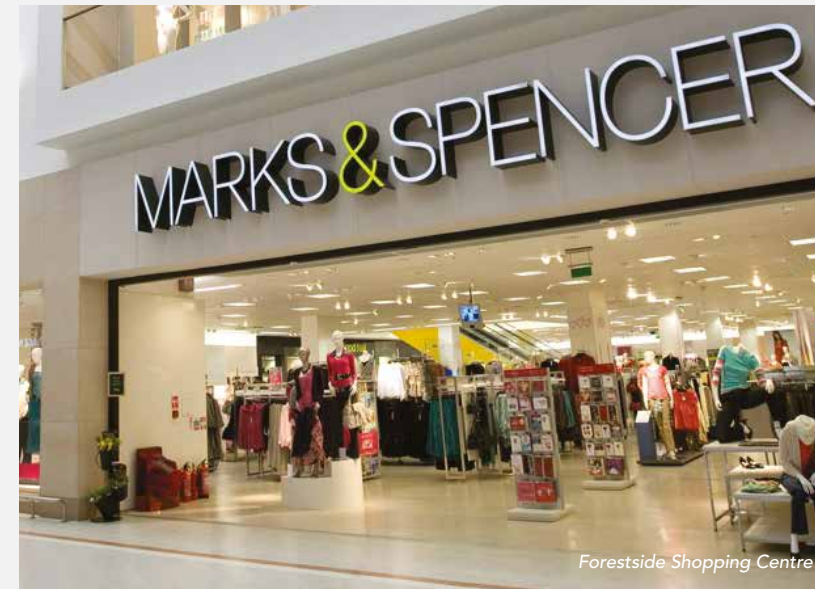
Forests Shopping Centre