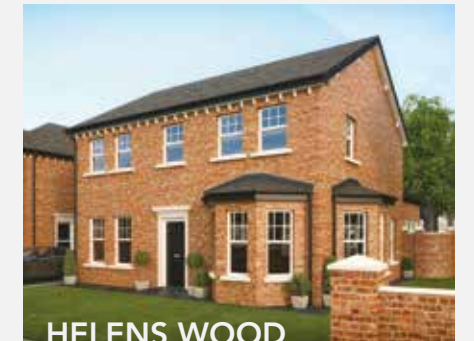
HELENS WOOD Bangor