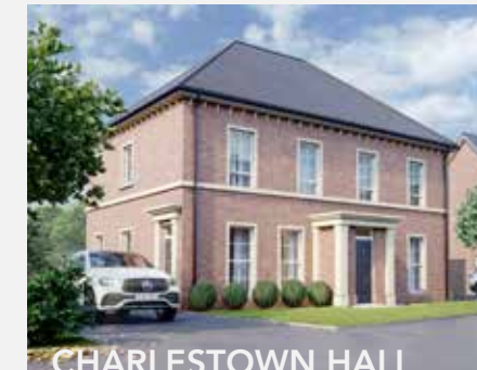
CHARLESTOWN HALL Lisburn