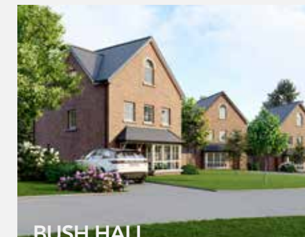
BUSH HALL Antrim